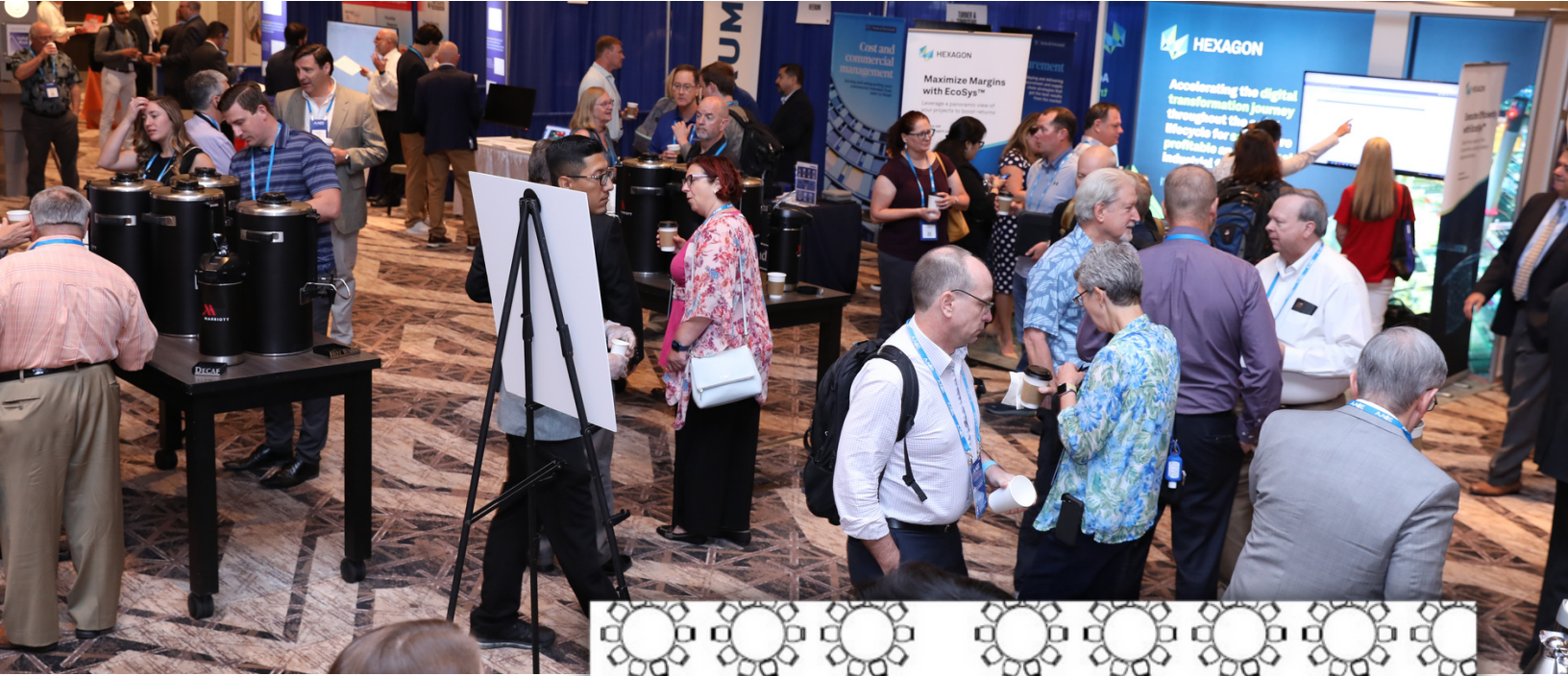
EXHIBIT HALL LAYOUT